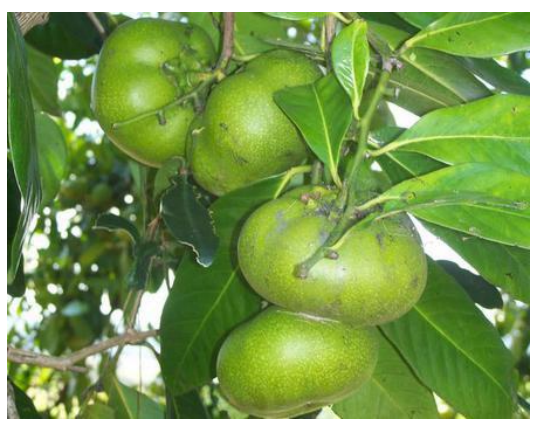
Black Sapote Fruit