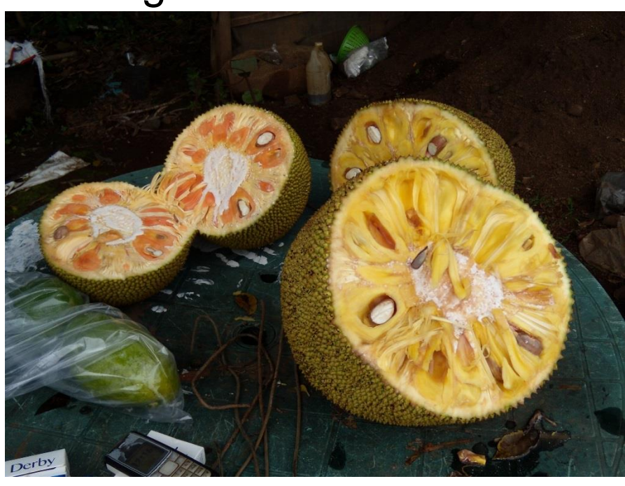
Bonita Springs Tropical Fruit Club Newsletter