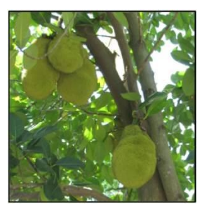
Jackfruit on the tree.