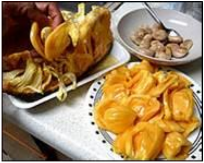
Jackfruit prepared for eating.

The seeds are edible if boiled or roasted. Remove the clear seed coat before processing them.